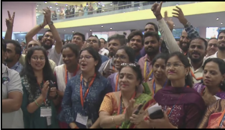
Members of the Chandrayaan-3 ISRO team celebrating the successful soft landing of the spacecraft on the Moon

In 2009, India's Chandrayaan-1 mission, the country's first lunar mission, detected water on the Moon concentrated at its poles. On Wednesday 23rd August 2023, India made history by becoming the first country to successfully land a spacecraft in the South Pole region of the Moon, as Chandrayaan-3's lander Vikram touched down.[...] India becomes only the 5 fourth country to soft land a spacecraft on the Moon, a remarkable achievement for humanity.