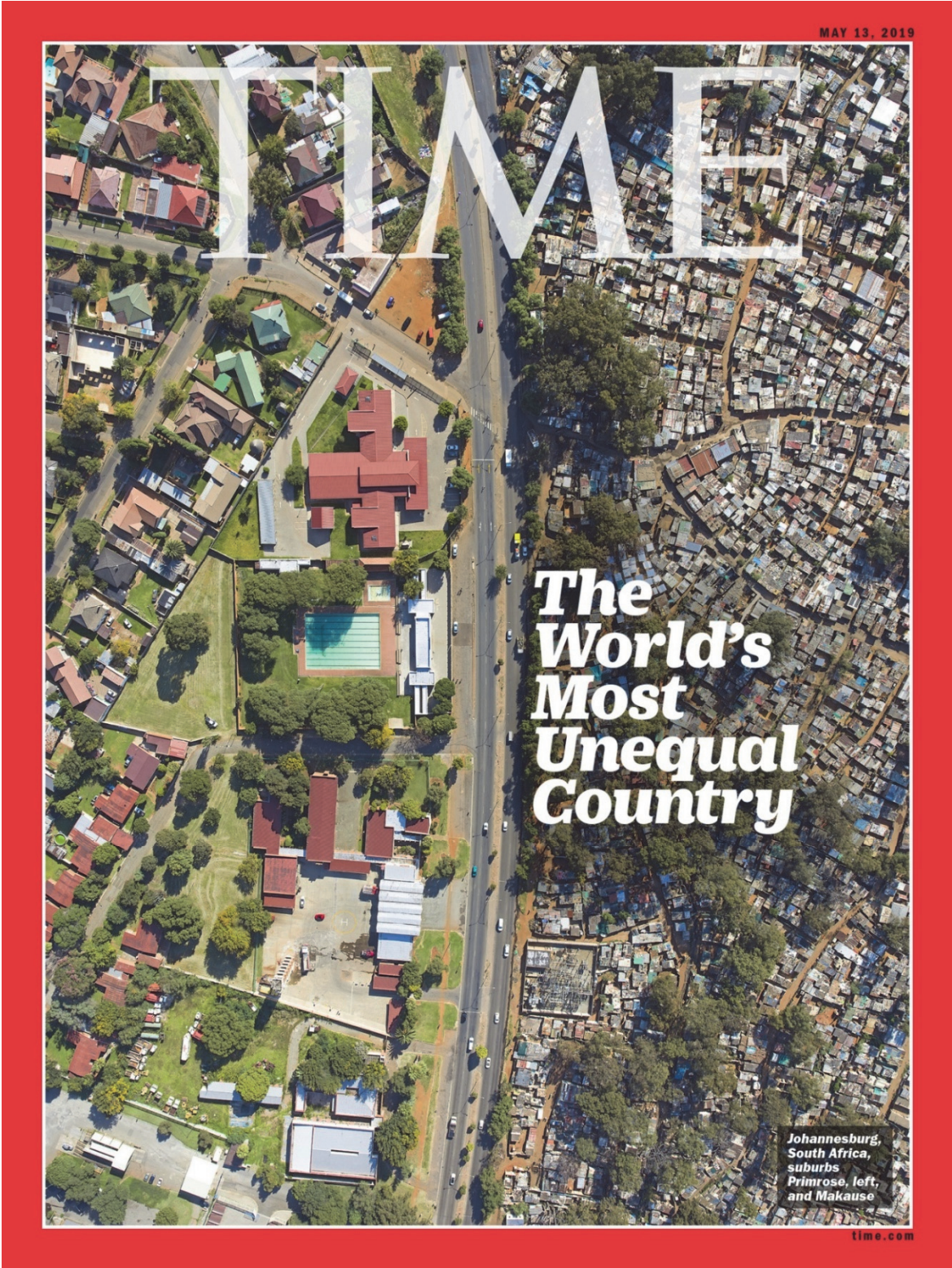
[Johannesburg, South Africa, suburbs Primrose, left, and township 1 of Makause, right.]